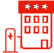
Charging at hotels