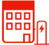
Charging during shopping trips