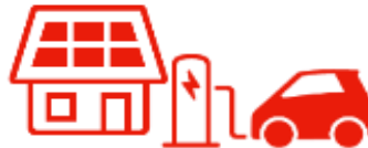
Charging at home