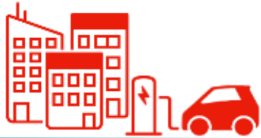
Charging in the city