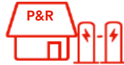
Charging on motorways