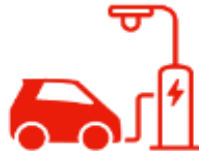
Charging at public parking spaces